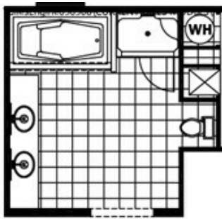
Opt. Venetian Bath